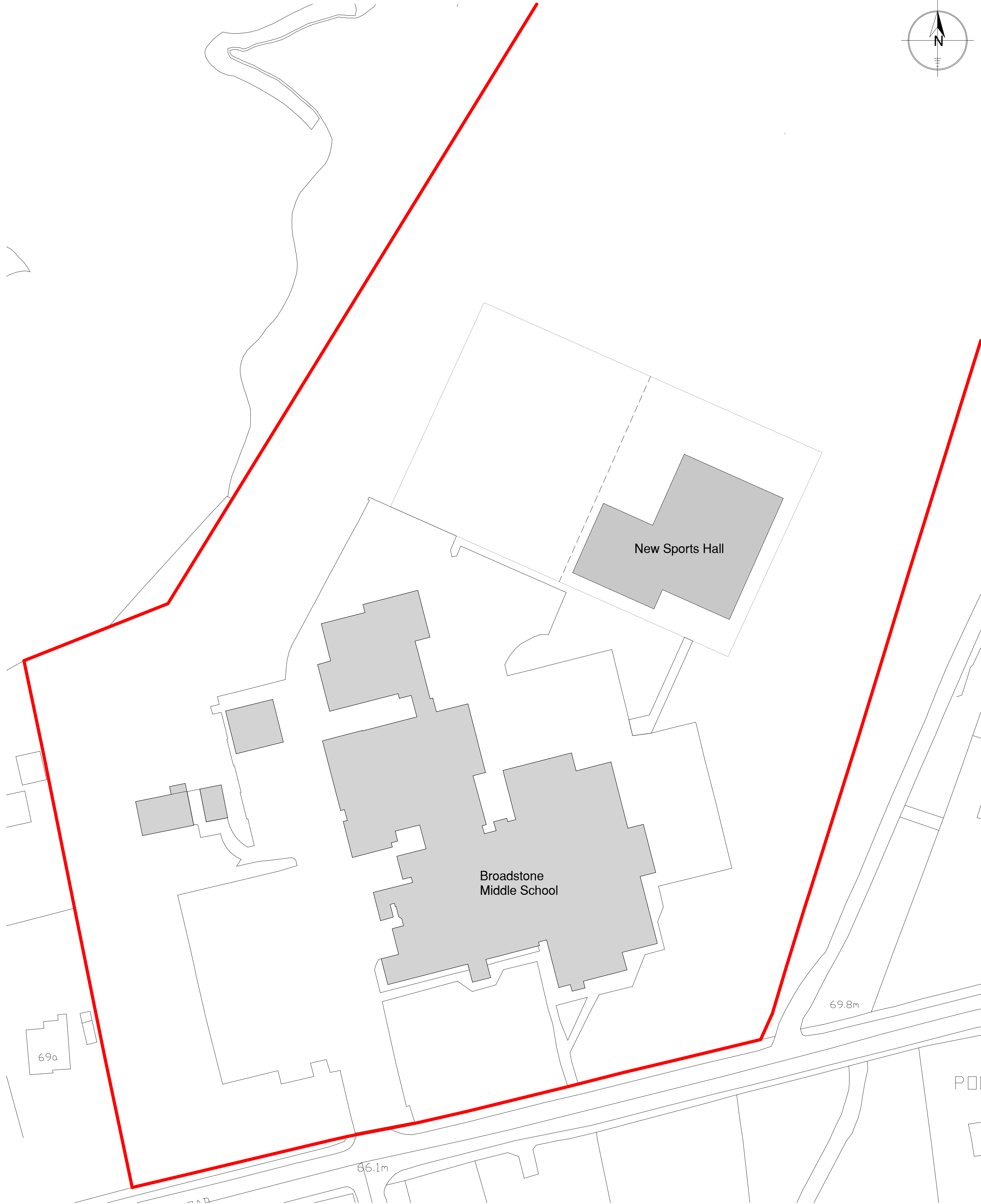
2 Block Plan (Proposed) 1 : 500