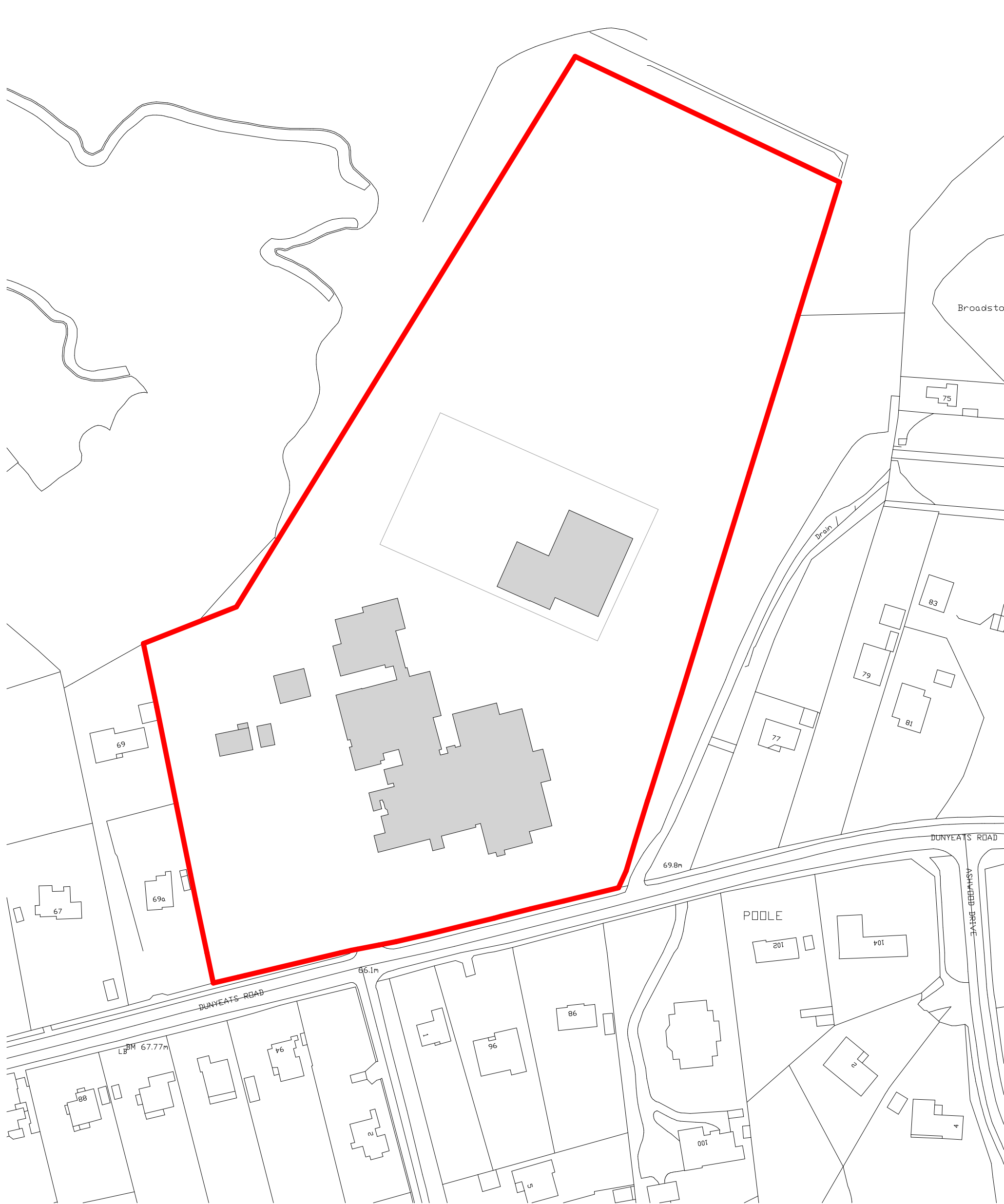
1 Location Plan (Proposed) 1 : 1250